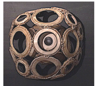
Tabla Geodesica ($1200) is an installation art piece made from used tabla pudis (the skins of the Indian classical tabla drum) donated by tabla schools and many musicians. Each round 'pudi' has had